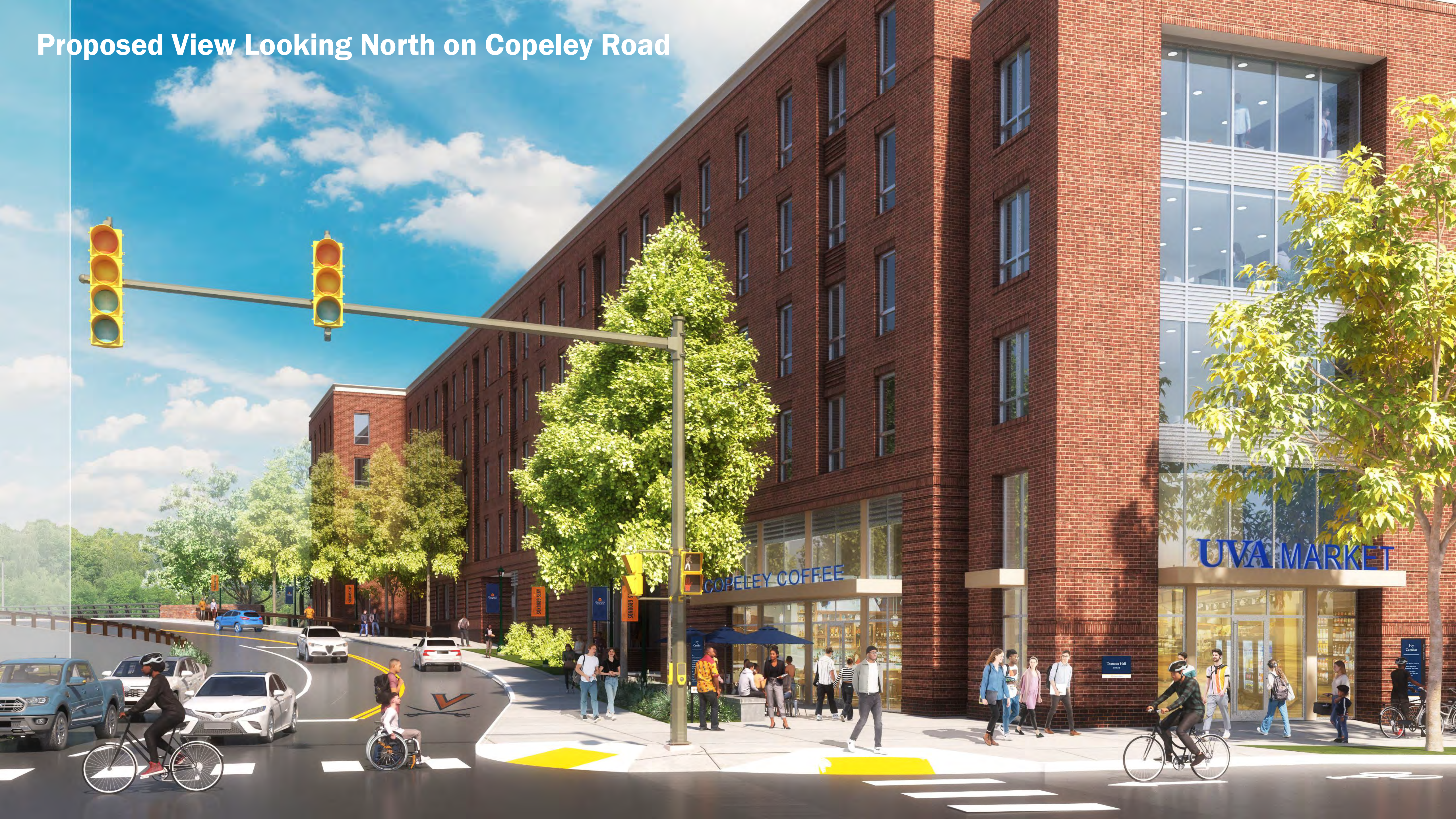
Proposed View Looking North on Copeley Road