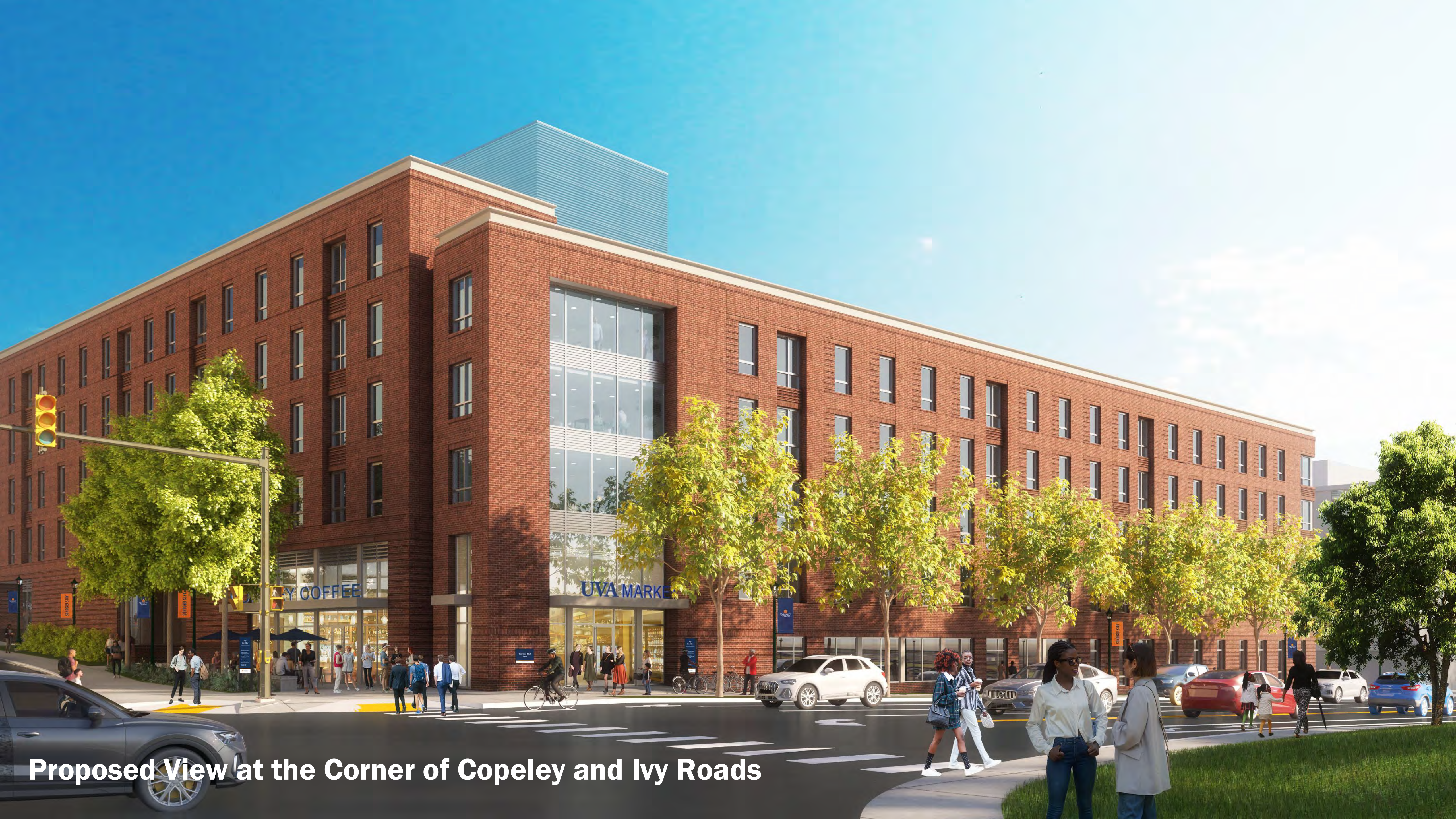
Proposed View at the Corner of Copeley and Ivy Roads