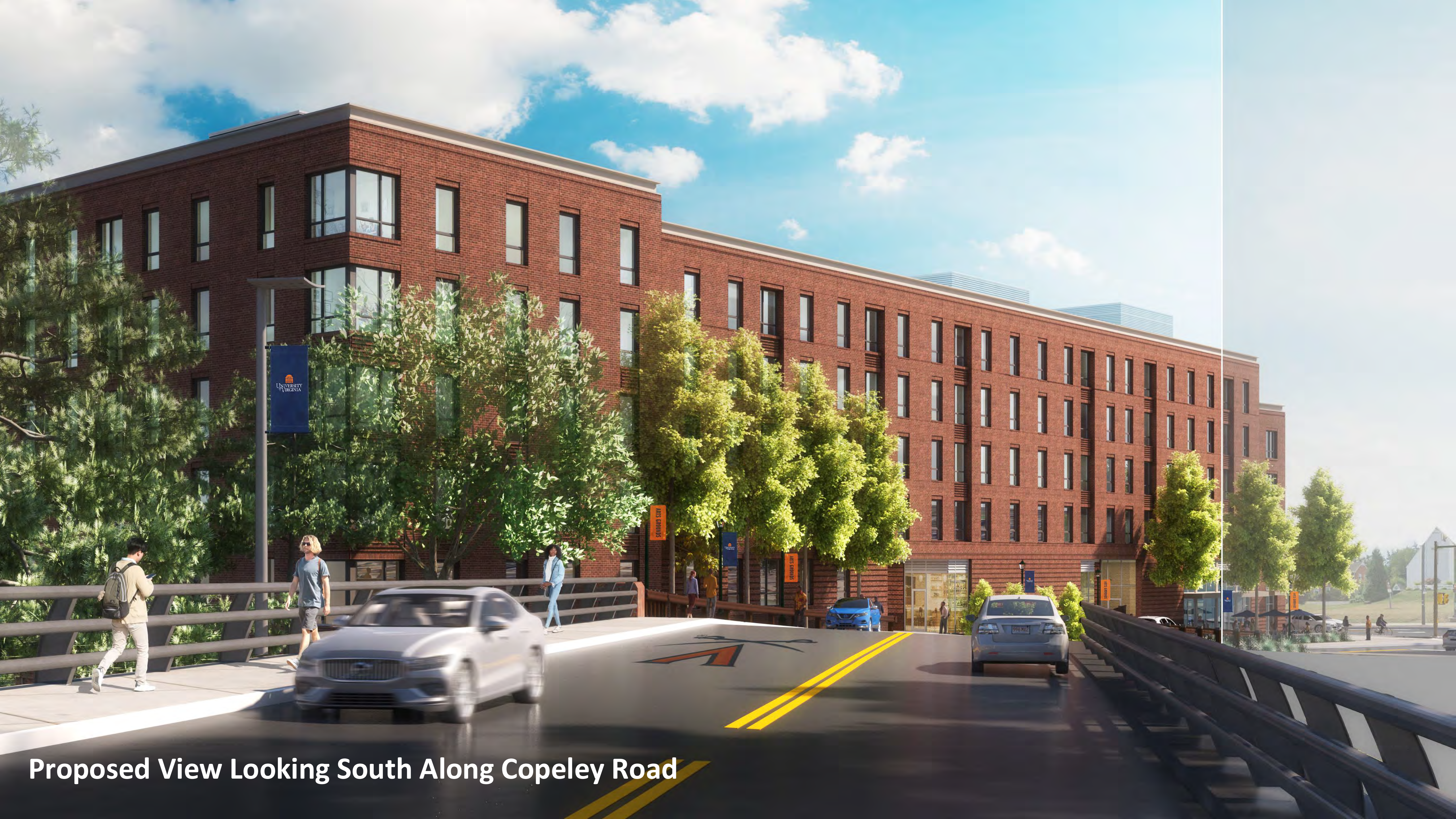
Proposed View Looking South Along Copeley Road