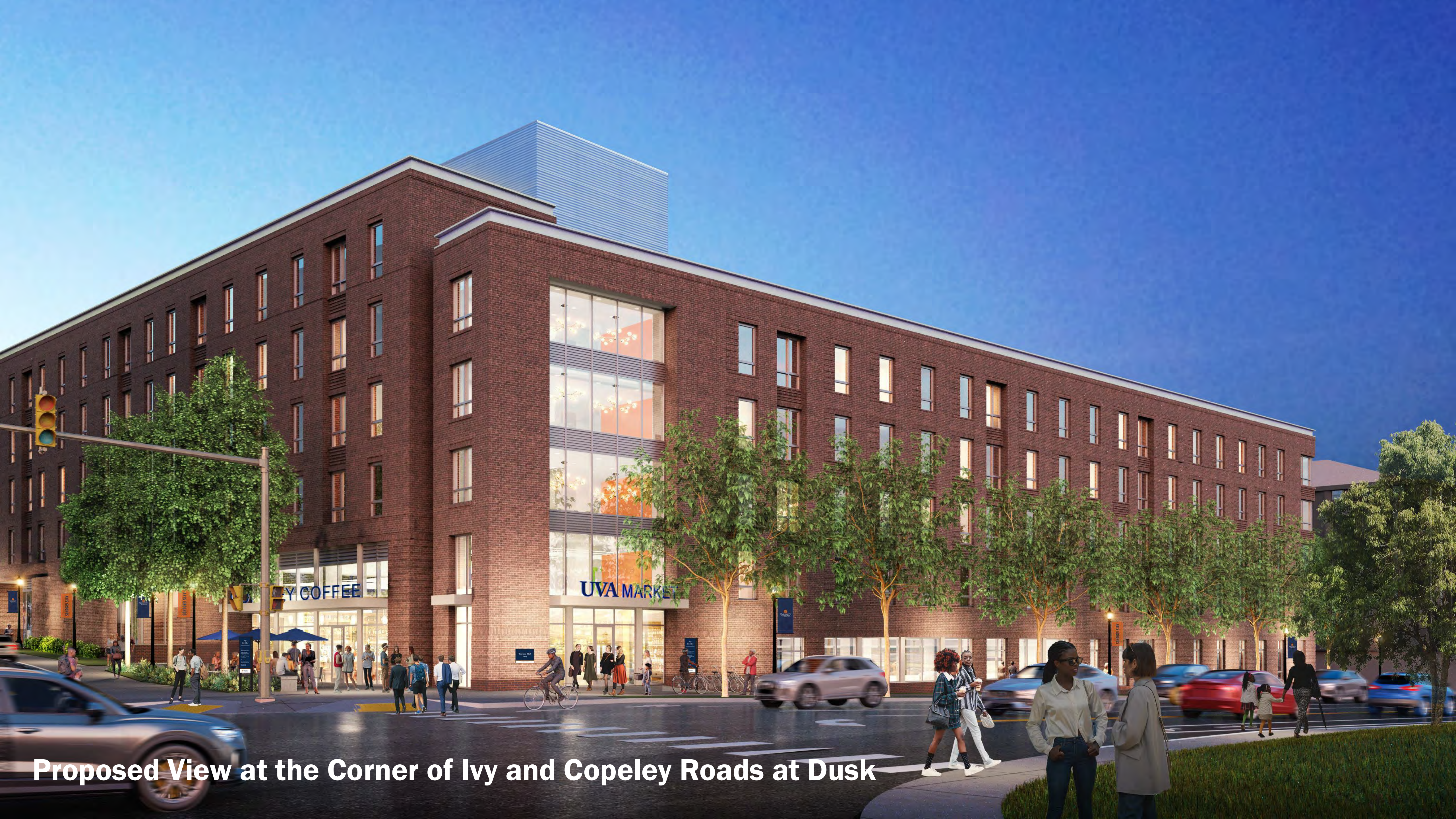
Proposed View at the Corner of Ivy and Copeley Roads at Dusk